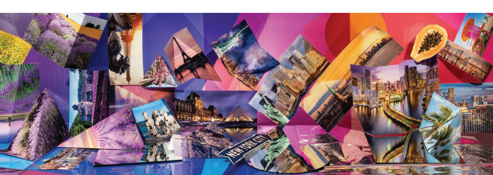
MRS-CDG-JFK-MIA, 2019, Photography, Dye-Sublimation Print on Aluminum

Samoylova creates her collages by printing, sculpting, assembling and re-photographing nature-themed images in the studio along with typical studio props and mirrors, building compositions as if they were three-dimensional mosaics. The resulting assemblages represent worlds constructed from memory, from souvenir postcards and picture albums of places visited and photographed. Like memory, those compositions are abstract, composed of fragments that make a whole. The aesthetic of these compositions parallel the artist's ongoing series Landscape Sublime.