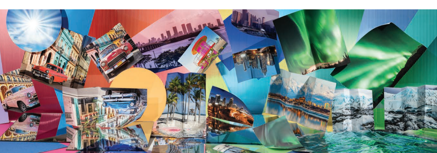
HAV-MIA-ATL-ANC, 2019, Photography, Dye-Sublimation Print on Aluminum

Anastasia Samoylova (born in Moscow; lives and works in Miami) moves between observational photography, studio practice and installation. Her studio-based project, Landscape Sublime, explores how social media images and the repetition of certain motifs informs an understanding of natural phenomena. In recent years she has worked in this mode for commissioned large-scale public art installations, as well as shown in several solo and group exhibitions. Landscape Sublime will be presented at the Wilhelm-Hack-Museum in Germany as part of the Biennale für aktuelle Fotografie 2020.