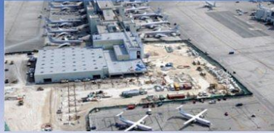
MIA American Eagle Regional Commuter Facility