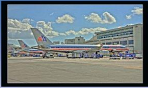
MIA North Terminal Development Program