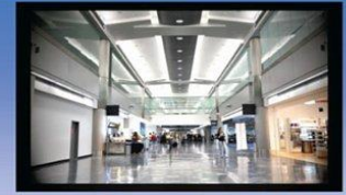
MIA Concourse A-D Interiors